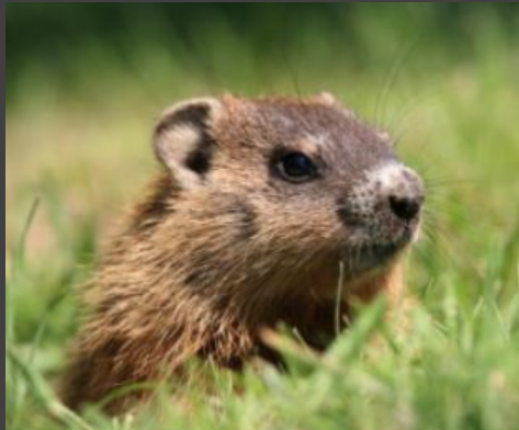
Ground Hog Day February 2